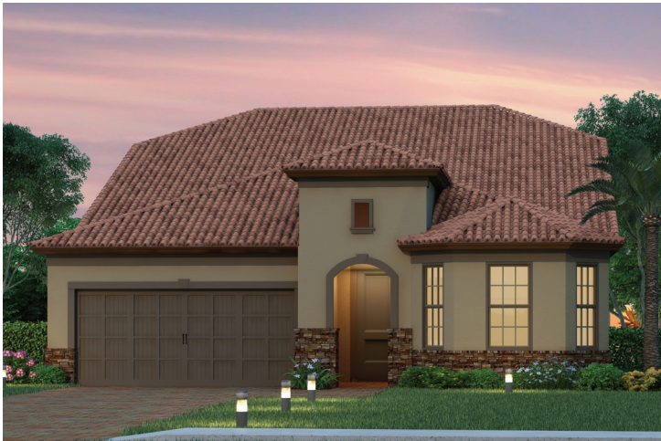
Elevation 4 Loft