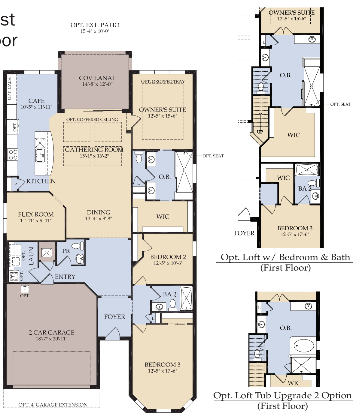
Opt. Loft w/ Bedroom & Bath (First Floor)