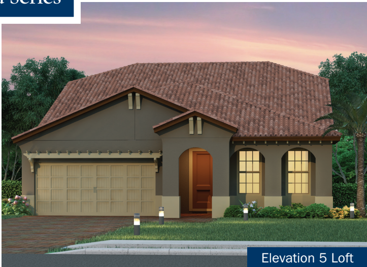
Elevation 5 Loft