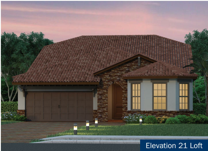
Elevation 21 Loft